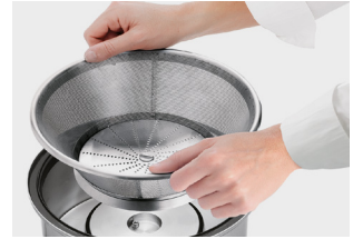
Easy to remove and clean

Cleaning is fast and easy. Magnetic filter and rest of the components in contact with foodstuffs assembling and disassembling processes are very simple due to no tools are required.