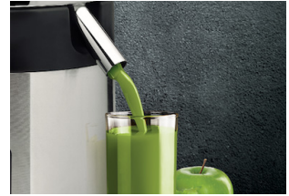
Smoothy direct to container

Strainer of the filter and toothed disc have been designed to obtain high quality fruit juices as well as offering an optimal performance with vegetables.